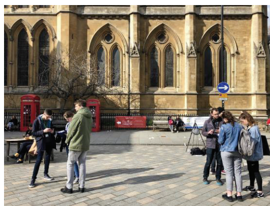
Figure 2 – The research team conducting a survey at Byng Place/Torrington Square in London in March 2019

The representative spatial recording will serve as the basis for the reproduction of a VR simulation in laboratory conditions and for testing physiological responses. It is performed to capture a consistent and representative five-minute period.