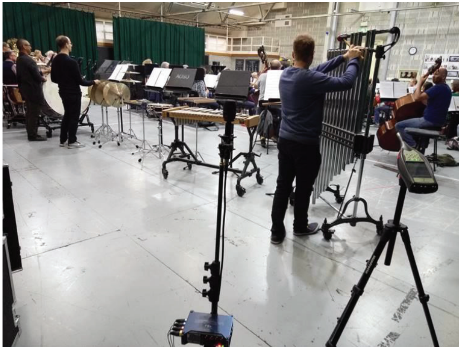
Figure 7. Measurements during rehearsals

A close collaboration with the orchestra players was considered essential, and incorporating the details and their experience into the design was paramount. The space is a difficult room to play in - the biggest issues being difficulty hearing other sections, resulting in poor ensemble and balance, and high noise levels. This is evident in rehearsals for both opera and ballet repertoire, and as a result conductors often have to spend considerable time trying to remedy the shortcomings of the room, at the expense of working on finer artistic and musical details.