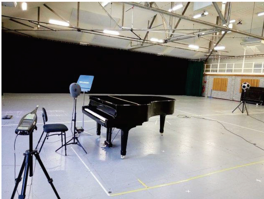
Figure 2. Acoustic measurements in an unoccupied rehearsal space

The volume of the studio is approximately 2400 m 3 and it has existing curtains, diffusion and some absorbers. The scope of the acoustic consultancy was to optimise the space to be more suitable in terms of reverberation and diffusion, as well as sound levels.