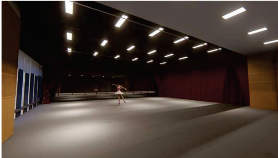
Figure 8. New rehearsal studio design (Courtesy of Visionata Architects and Norrebro Design)

When designing a new rehearsal space, opportunities and challenges are different from the upgrade of an existing studio. Whilst design for acoustic excellence in terms of the objective parameters is possible with a good team of acousticians, the detail work in terms of coordination with the orchestra, chorus, opera singers, but perhaps most importantly the design team is paramount.