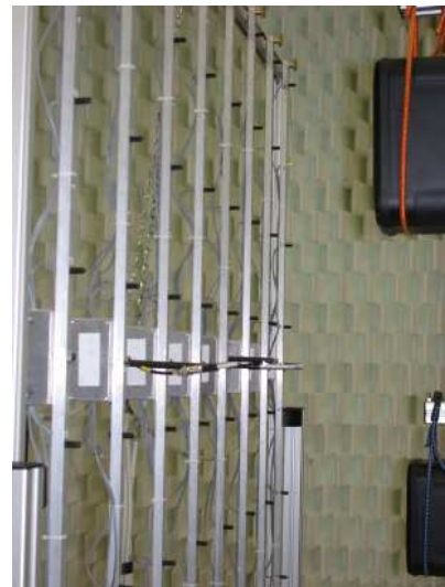
Figure 2: Microphone array: 64 microphones, two reference microphones and two loudspeakers in a hemianechoic room.

Eight microphones are mounted to each of eight thin vertical aluminum rods, which in turn are mounted in a portable square frame such that their horizontal spacing can be adapted to match the vertical spacing of the microphones (currently d = 0.2 m, adjustable to d = 0.1 m). The 64 microphones require only eight amplifiers since each set of eight microphones can be connected individually to the eight amplifiers by means of an eightfold switch [5]. The complete microphone array is depicted in Fig. 2.