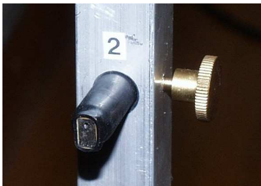
Figure 1: Detail of a tube-mounted silicon microphone.

The microphone array was designed at the Department of Mechatronics and Machine Acoustics, Darmstadt University of Technology [5]. It consists of 8 \times 8 silicon microphones (type SP0101NZ2-2 from SiSonic), which are usually used for electronic devices such as mobile phones, hearing aides, video cameras, etc. These silicon microphones are mounted in small circular plastic tubes to allow an easy calibration with standard microphone calibrators. Figure 1 shows such a tube-mounted microphone. The silicon microphones are temperature and shock resistant and, due to their small mass, very insensitive to structure borne noise. They have a flat frequency response in the frequency range of interest, which