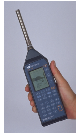
Figure 2: The STIPA method is implemented as a program option in the sound level meter Norsonic Nor118. Both STI- and CIS-value are presented, without and with a virtual background noise level.