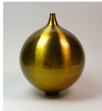
Figure 1: The cavity resonator, a tool developed, studied and abundantly employed by Helmholtz in his lab. There are several instruments that are based on the resonator, together with others that are being created by the authors and collaborators. They will be used in the Rhapsody, with conventional instruments.

being performed by an orchestra. The authors also conceived a reduced instrumental version of the Coriolan Overture for a woodwind quintet, a string quintet (with double bass) and a pair of timpani.