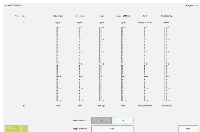
Figure 2: A screenshot of the questionnaire GUI in MATLAB. “A” refers to the reference, whereas the condition under test is labeled “B”.

In the experiment, the subjects were presented two conditions at a time, i.e., the reference and a condition under test (which was either the stereo anchor or one of the upmixed versions). After having listened intently to both conditions, the subjects were asked to rate the perceived quality of the condition under test relative to the reference. Each of the verbal descriptors had to be rated on a continuous bipolar scale that ranges between \pm 3 , where a value of zero marks the middle (“no difference perceived”). Whereas a positive difference rating indicates that the subject perceived the condition under test to be higher in spatial quality than the reference, a negative difference rating translates to the opposite. To control for possible confounding factors, the musical pieces and conditions were presented in random order. The order of the verbal descriptors was also randomized across subjects, but not varied between comparisons to reduce the cognitive load. The questionnaire which allowed the participants to control the audio playback and enter their